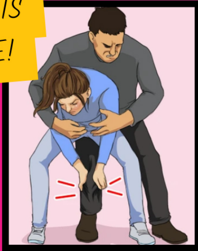
Step left or right and drop your weight